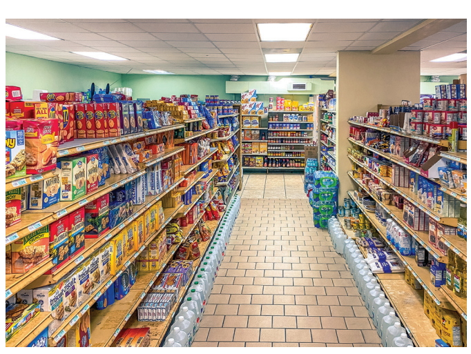
Businesses are working hard to reestablish themselves, with inns, marinas, restaurants, shops and grocery stores finally reopening their doors.

According to Pleydell-Bouverie, speaking specifically for Man-O-War, "All of the navigation channels are clear of obstructions, and navigation lights have been replaced. Moorings are in place for visiting boats, and fuel is available as well." While there are still a few derelict boats remaining along the shoreline, most have been removed. "Of the approximately 80 boats washed onto land, only about 20 remain," he says.